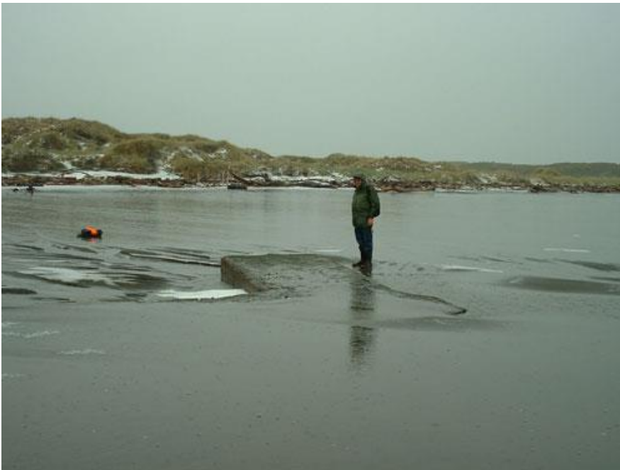
Pillbox by the mouth of the Kaitoke Stream (Welch 2004 vide Waters 2005).