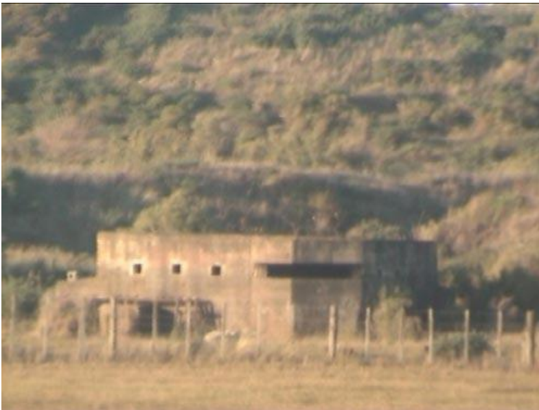
Pillbox on south runway, Wanganui Airport (Waters 2003).