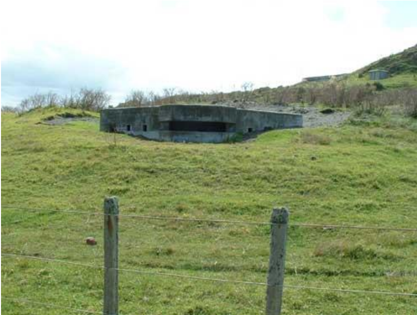
Pillbox on Airport land across from Coastal battery (Welch 2004 vide Waters 2005).

WHANGANUI DISTRICT COUNCIL Te Kaunihera a Rohe o Whanganui