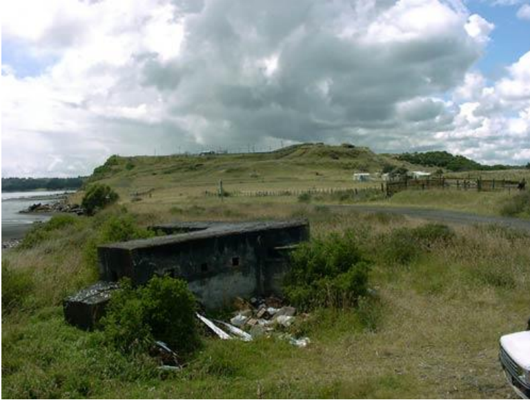
Pillbox on river south edge, north of Airport, Languard Bluff (Waters 2002).