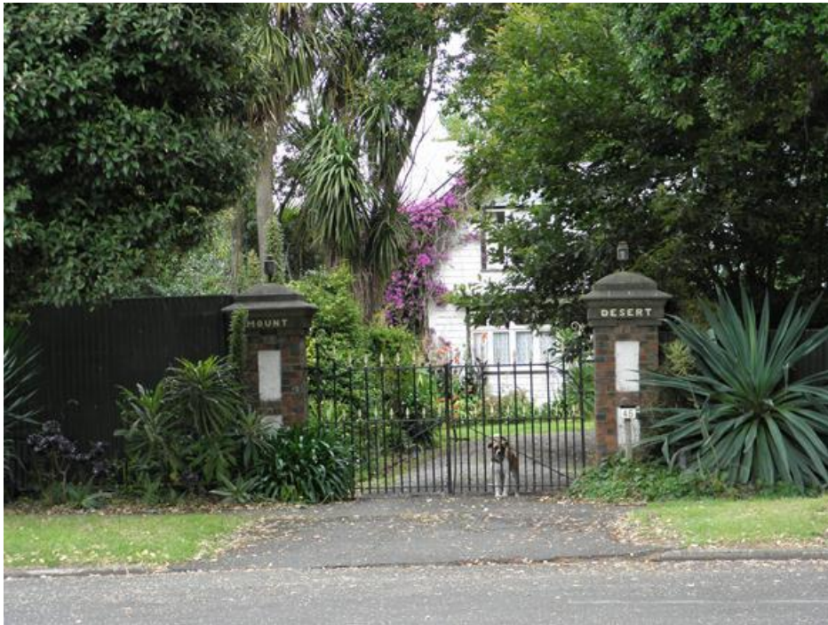
Mount Desert front entrance, 45 Bedford Street. Photo: Val Burr, March 2012

WHANGANUI DISTRICT COUNCIL Te Kaunihera a Rohe o Whanganui